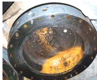
Corrosion caused by water in fuel from leaky check valves