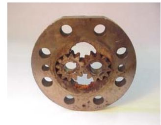
Gears fused to corroded case