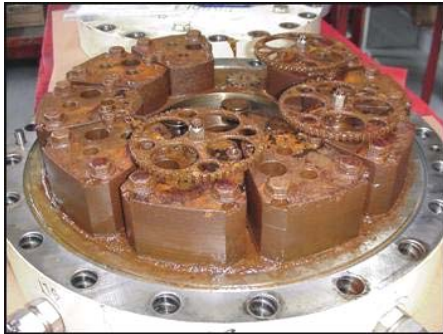
20333 Type 1 Frame 9FA Flow Divider