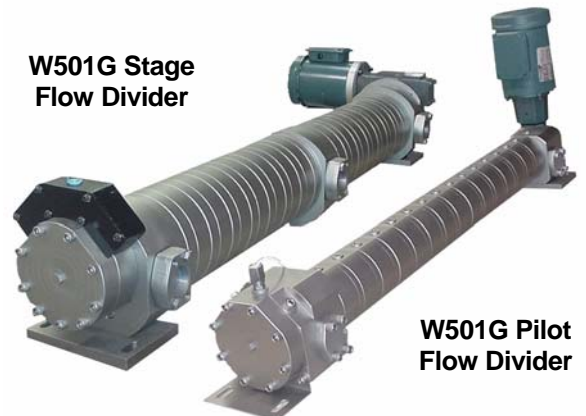
W501G Pilot Flow Divider